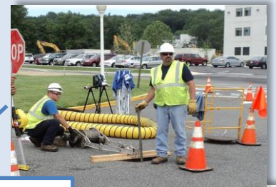
Utility vault set-up & safety preparations

"We are very pleased with how the Flow-Liner CIP-Conduit installation was performed by your Installer. The conduit lining crew was very professional, courteous, and kept us informed – a top notch crew. They did a great job for us in a timely manner. The conduit lining saved us from having to dig up and replace the conduit, which would have been very costly, inconvenient, and most likely not feasible. We highly recommend your product and consider it a viable option compared to conduit replacement."