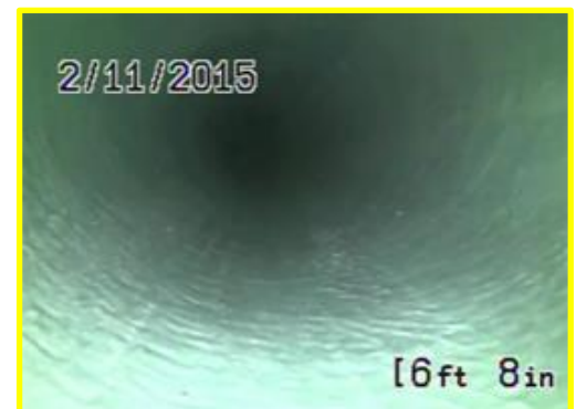
4" Drain pipe after Flow-Liner® Installed

We are pleased to announce another successful project and proudly add McDonald's Restaurants of Ohio, Inc. to our list of happy and satisfied customers.