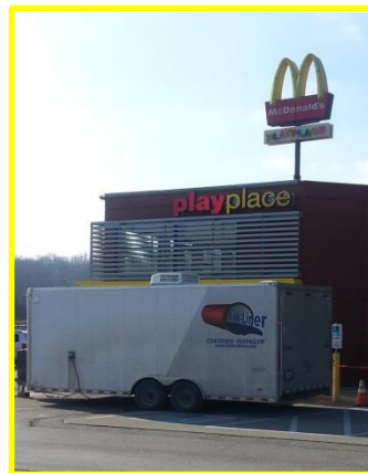
Flow-Liner equipment set-up for installation

The drain pipe was successfully lined without disruption to the operations at the McDonald's Restaurant. The McDonald's representative indicated they were happy with the results of the pipe lining.