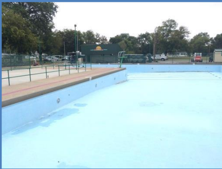
Harrisburg Township Park Pool