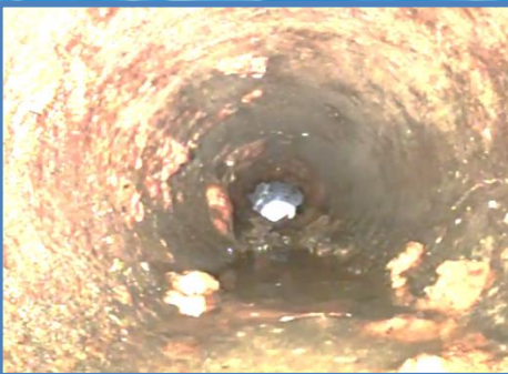
Before Flow-Liner® Installation

A Flow-Liner® certified installer cleaned three lines ranging from 4” to 8” and installed Flow-Liner®’s Cured in Place Pipe Lining System.