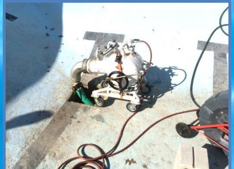
Flow-Liner® Inversion System

The Harrisburg Township Park District Pool was losing over 3000 gallons of water a day due to their leaking underground pipes.