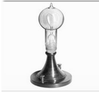
The First Light Bulb