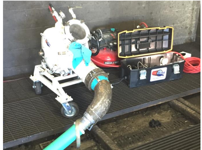
Cured-in-Place-Pipe Lining in Progress

A Certified Flow-Liner® Installer using the Flow-Liner® Drain Inversion™ System, a Cured-in-Place-Pipe lining method, lined the drain pipes. After navigating many bends and reinstating branch lines, the air test came back leak free- a success.