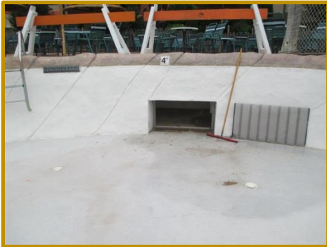
Access to 12” ID Pipe in drain sump

Kalahari Resorts and Conventions have locations in Wisconsin Dells, Wisconsin and Sandusky, Ohio. The Sandusky Kalahari Resort location, built in 2000, prides itself as America’s largest indoor waterpark. The facility also consists of a large outdoor waterpark, a lazy river with uphill water roller coasters and the region’s only dual indoor FlowRider® for bodyboarding. Kalahari Resort is open 24 hours a day, 7 days a week, 365 days a year and has something for everyone to enjoy whether you prefer to be wet or dry.