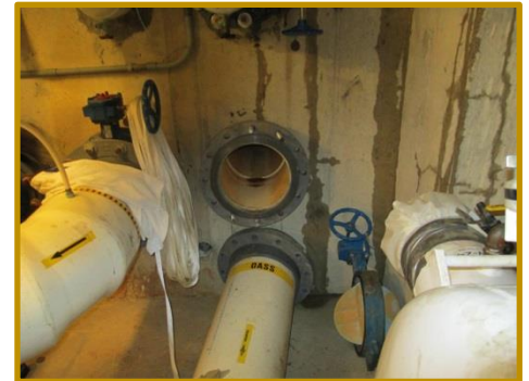
Access to 12” ID Pipe in the Pump Room

“We are very happy with the Flow-Liner installer and pleased that we didn’t have to dig up and replace the leaking pipe.”