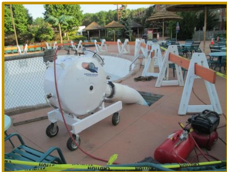
Flow-Liner® Equipment Set-up