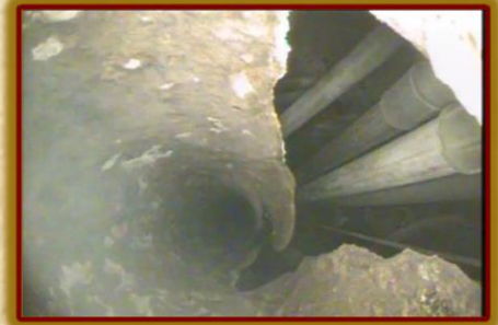
Deteriorated Cast iron pipe prior to lining

“I would like to thank everyone at Flow-Liner who worked with us to successfully complete our pipe lining project. The team was professional, polite, and totally committed to making this solution work.”