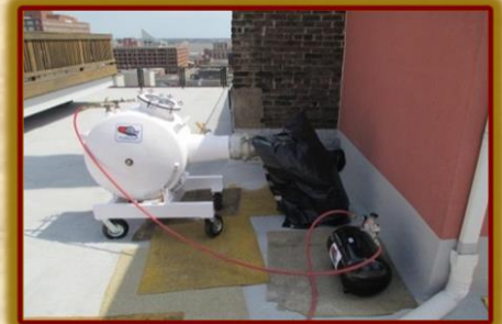
Flow-Liner® Equipment Set-up